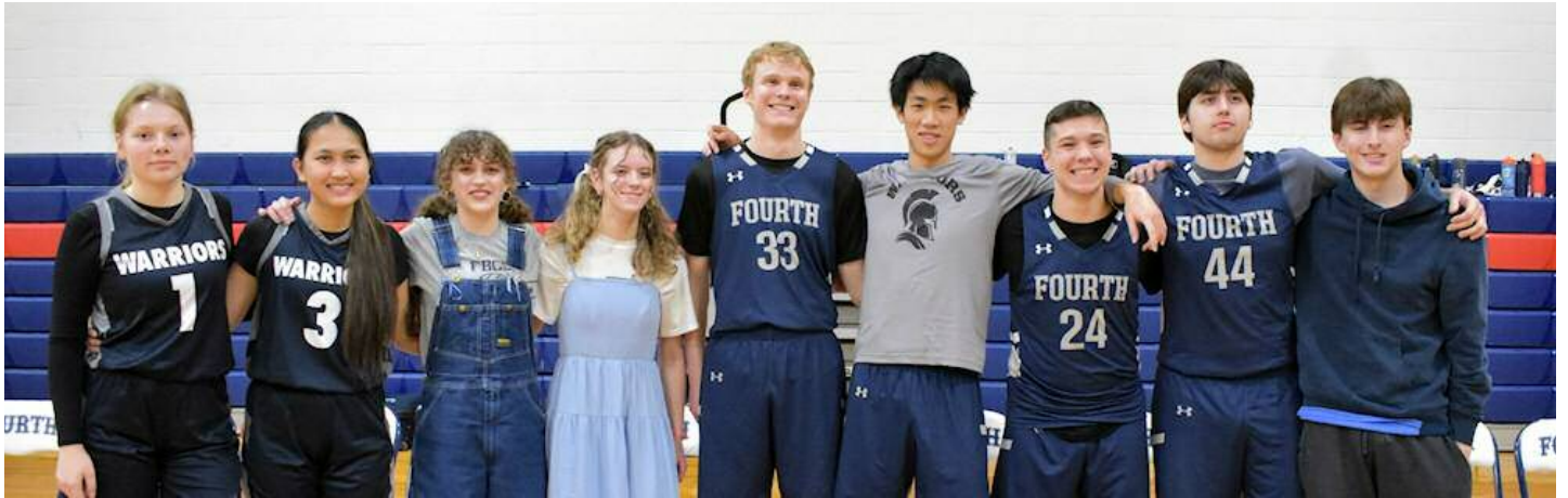
Senior Basketball Athletes and Managers